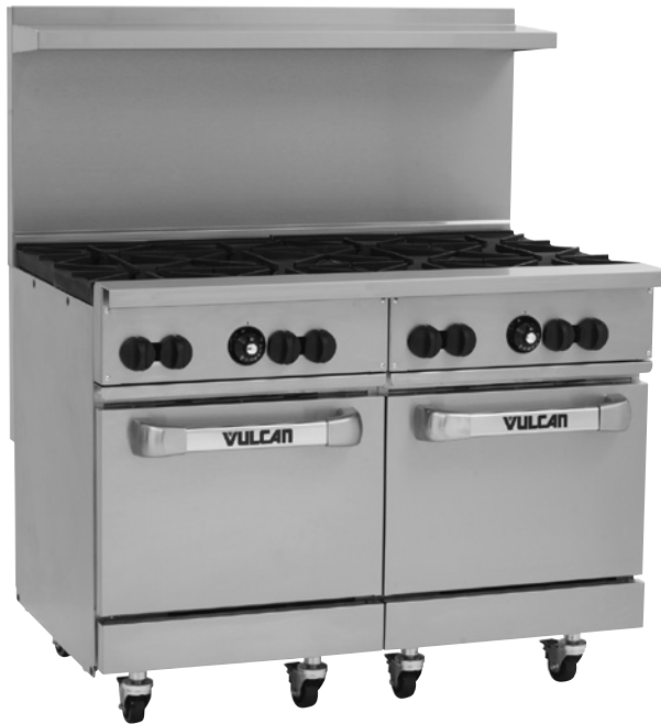
Model 48SS-8BN (shown with optional casters)