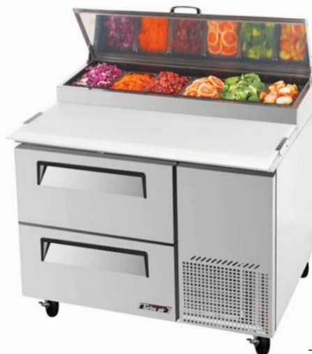
- Drawer pans not included.

EXCEPTIONAL 3 YEAR PARTS & LABOR WARRANTY