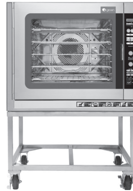
ComboEase Model CBE-10G shown with optional stand on casters

A high efficiency gas combustion chamber heats the cooking cavity in steam, combo and oven modes. All condensate exits through cavity drain. Oven/steam vent is provided. Safety or low water cutoff provided and reservoirs automatically drain when unit is turned off. Standing pilot with electronic ignition is standard.