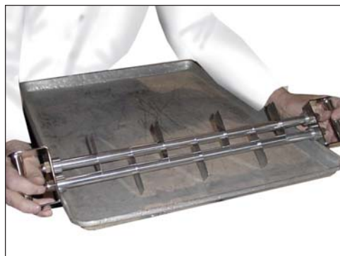
Correct Cutter Position For Cutting

With the blade tilted at an angle as shown at right, the cutters will cut nutmeats and other hard products against the bottom of the pan and will not rake the particles up through the iced surface.