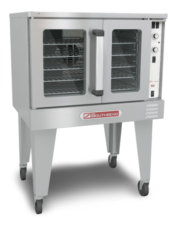
(SLGS/12SC shown with optional casters)