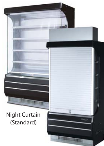
Night Curtain (Standard)