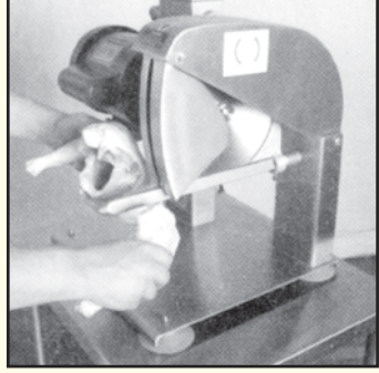
Right drumstick and thigh removal.

THE BIRO MANUFACTURING COMPANY 1114 WEST MAIN STREET MARBLEHEAD, OH 43440-2099 U.S.A. Phone: (419) 798-4451 Fax: (419) 798-9106 http://www.birosaw.com sales@birosaw.com