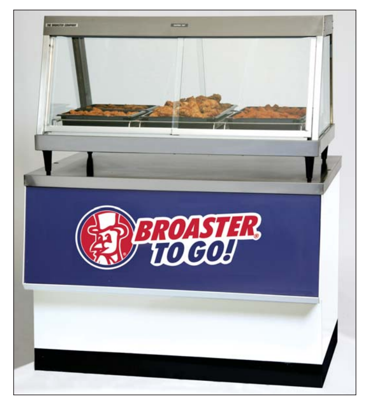
GRHD-3P with stainless steel finish (shown with optional passthrough doors and 4' metal module base cabinet).