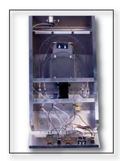
Drawer assembly view with bottom cover removed.