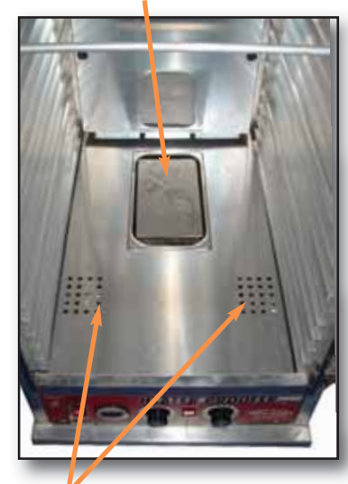
Air baffle and circulating air blower provide even heat distribution.