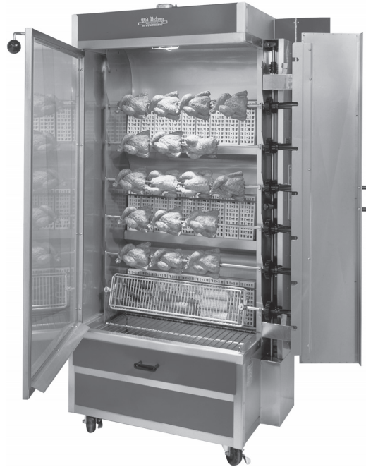
N/7G with Pivot Doors Shown