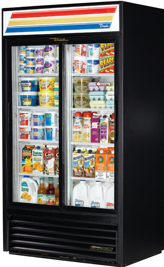
Shown with optional black exterior.