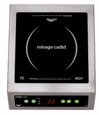
Mirage<sup>®</sup> Cadet 59300 Countertop Induction Range