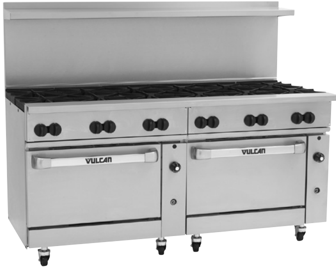
Model 72SC-12BN (shown with optional casters)