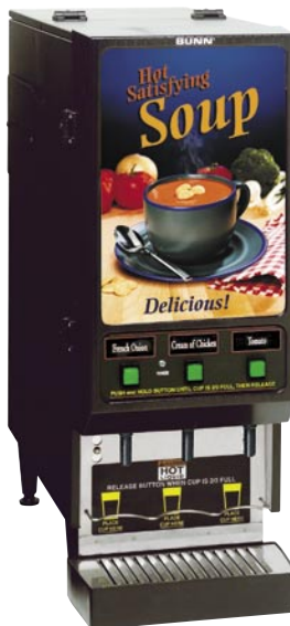
FMD-3 front display panel